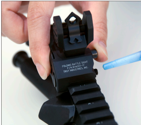
1. Unscrew clamp assembly and place sights at desired locations.

WARNING! Observe safe firearm handling practices at all times. Make sure the firearm is unloaded and safety is engaged before starting installation.