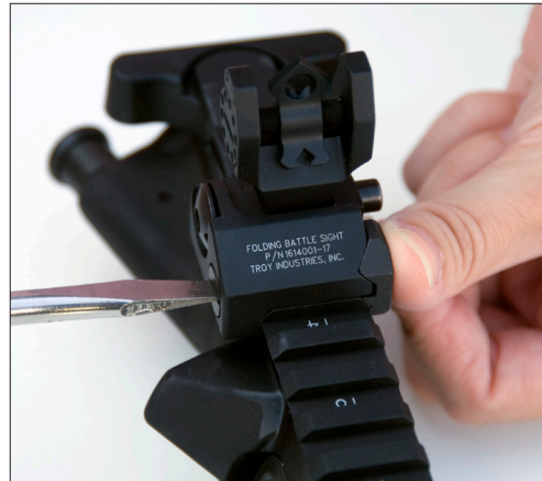
3. Replace clamp and tighten screw while pushing sight forwards against cross-slot.