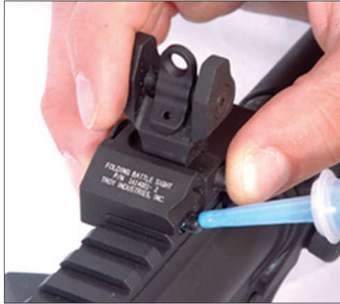
2. Apply one drop of thread locking compound to exposed threads.