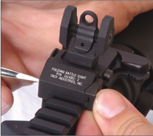
1. Unscrew clamp assembly and place sights at desired locations.

WARNING! Observe safe firearm handling practices at all times. Make sure the firearm is unloaded and safety is engaged before starting installation.